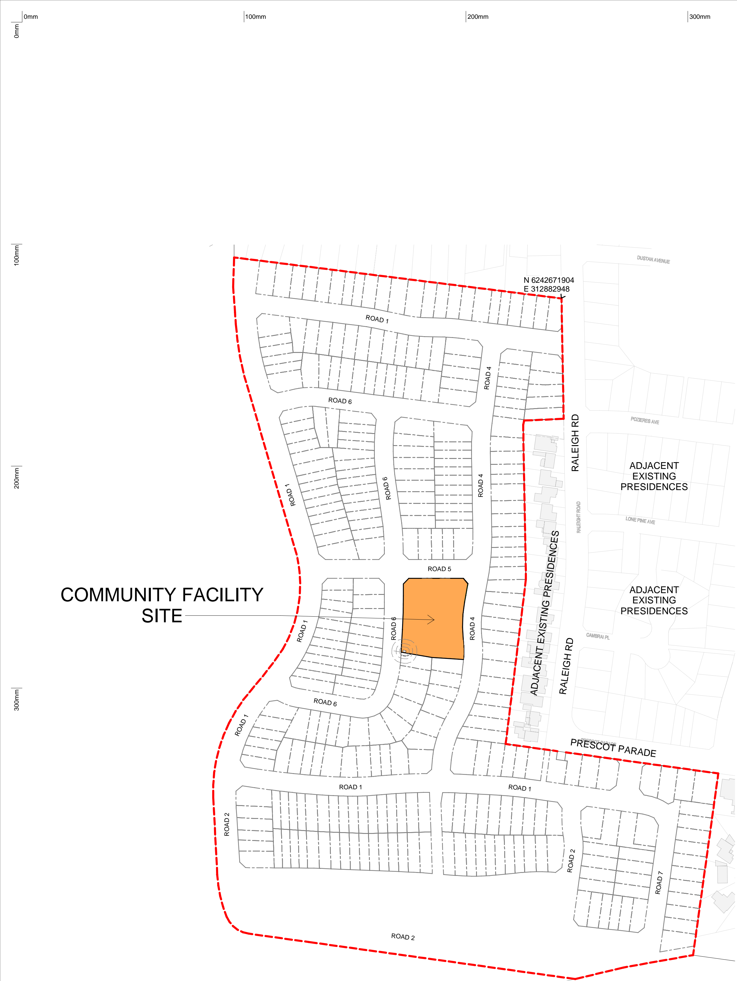
1 LOCALITY PLAN 1 : 2000